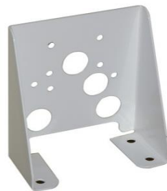
Bracket for Hold Open Magnets