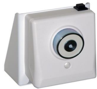
AEM0351 on bracket